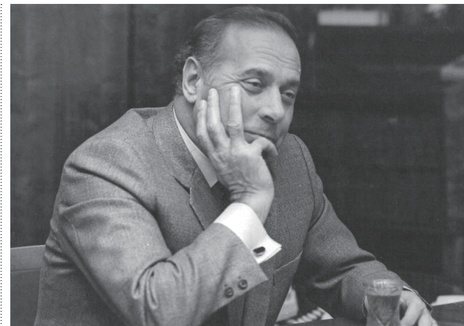
Heydar Aliyev is revered by Azerbaijanis as the founder of the independent state of Azerbaijan. AZERBAIJAN EMBASSY

Overcoming many internal and external challenges, the great leader launched an